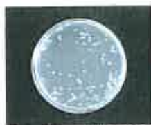
Escherichia coli ATCC 25922