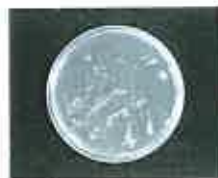
Staphylococcus aureus ATCC 6538