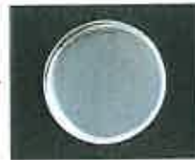
After 24 hours