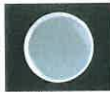
After 24 hours